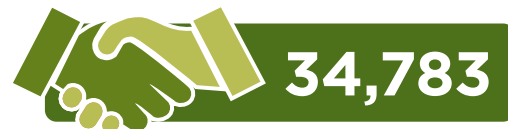
Hours of family engagement opportunities